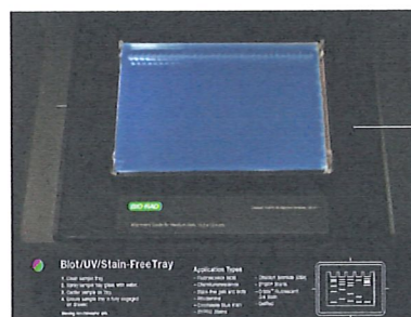
Alignment template for medium gels