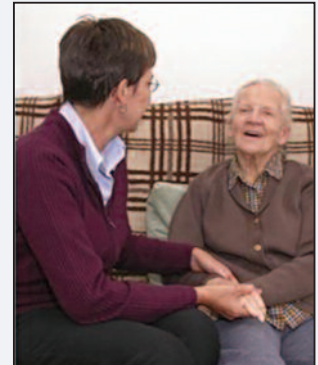
The Oxford Project to Investigate Memory and Ageing (OPTIMA)